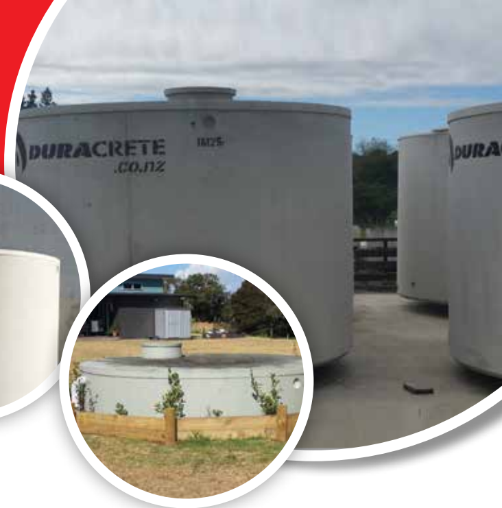
Standard Flat Top 25,000L Tank Above Ground