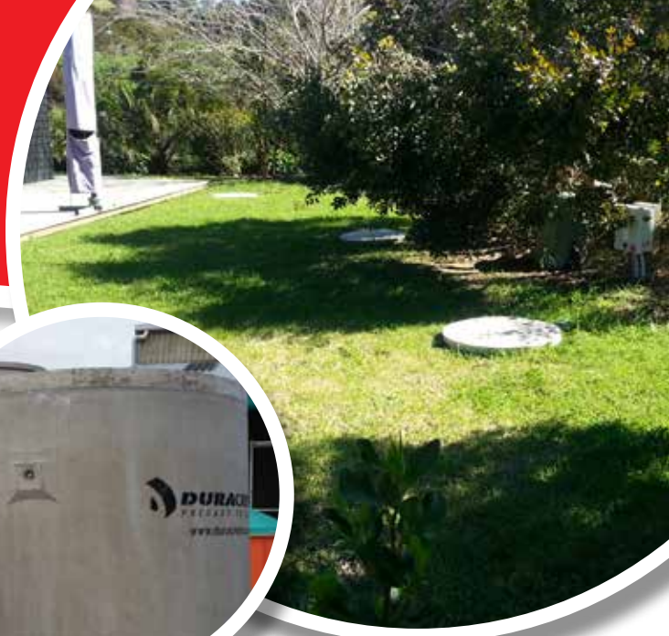
Examples of completed installations