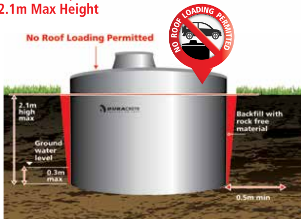
Standard 25,000L Tank Buried to 2.1m Max Height