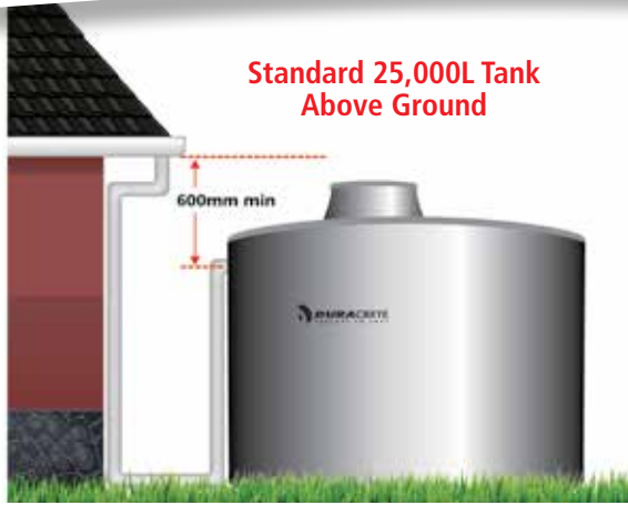
Standard 25,000L Tank Above Ground

Attenuation tanks are often required as part of building consents by local authorities.