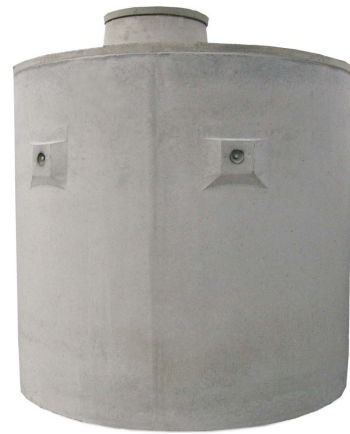
9,500L Attenuation Tank