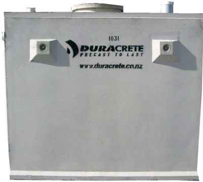
5,000L Attenuation Tank