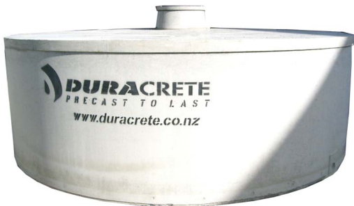
12,500L Standard Attenuation Tank