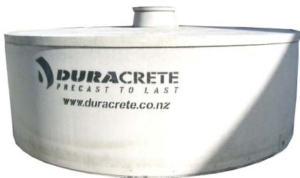
12,500L Underground Attenuation Tank