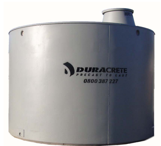
25,000L Attenuation Tank