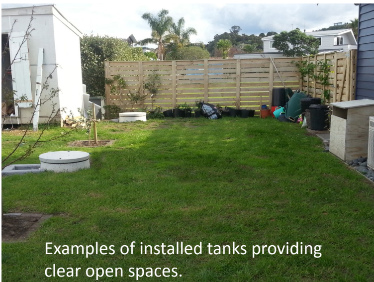
Examples of installed tanks providing clear open spaces.