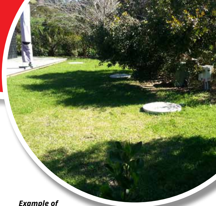
Example of completed installations

Manhole lids are manufactured to take a maximum loading of 500kg