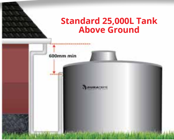
Standard 25,000L Tank Above Ground

Attenuation tanks are often required as part of building consents by local authorities.