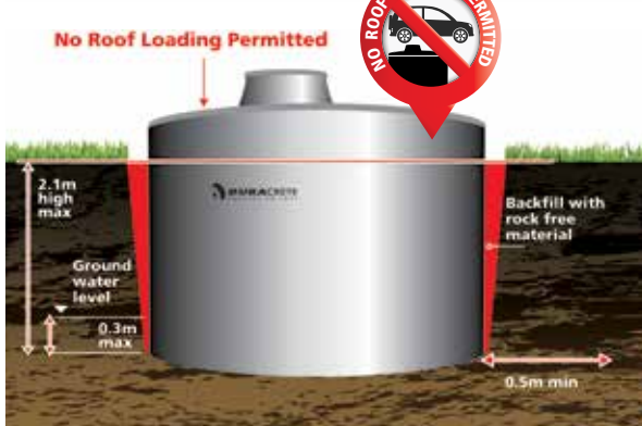
Standard 25,000L Tank Buried to 2.1m Max Height