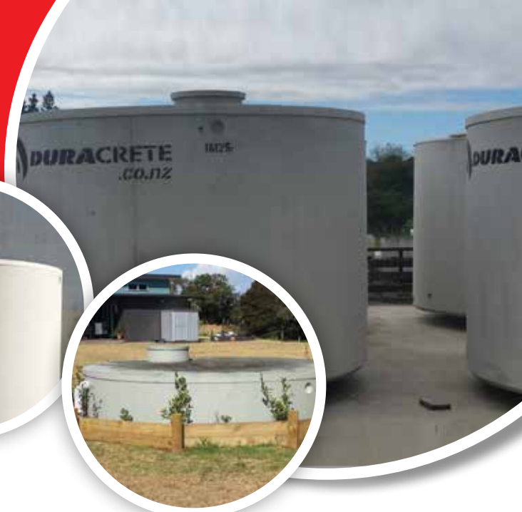
Standard Flat Top 25,000L Tank Above Ground