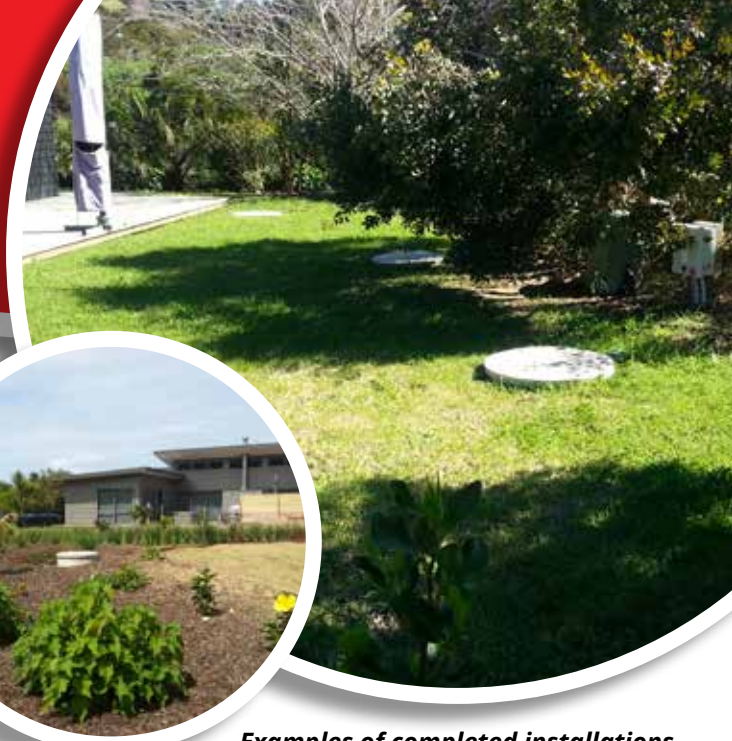
Examples of completed installations

*Please note the manhole riser and lid are not designed for vehicles. Manhole lids are manufactured to take a maximum loading of 500kg.